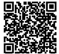
Children rearing portal site