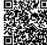
National Tax Agency website Tax return Movie