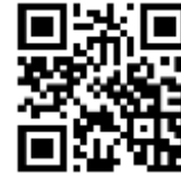
National Tax Agency website “Tax consultation Chabot”

▶ When you enter a question, “Tax official Futaba” an AI will answer.