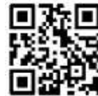
Dedicated application form